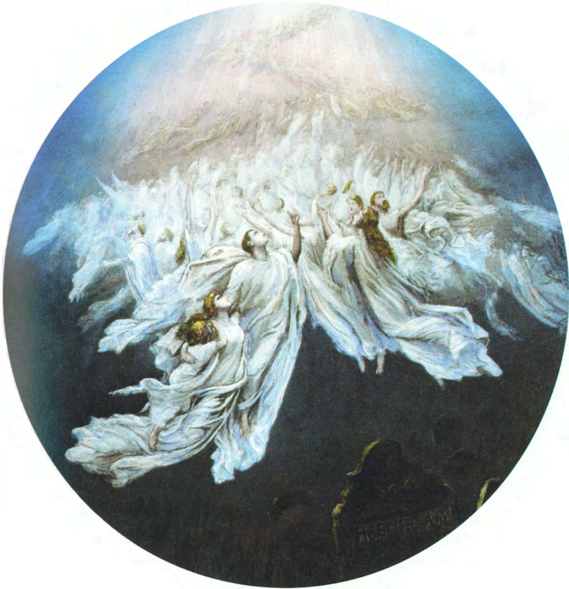
Figure 17. The Spirits' Flight , 19 th century British illustration 83