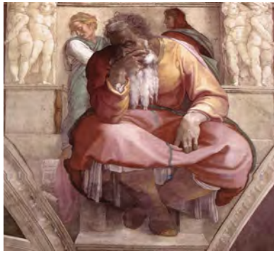
Figure 13. Michelangelo Buonarroti, 1475-1564: Jeremiah , 1511