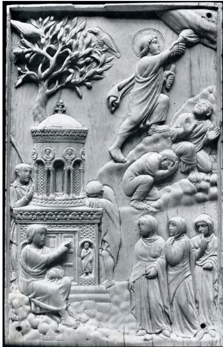
Figure 16. The Woman at the Tomb and the Ascension , ca. 400

Summarizing other ancient literature relevant to this passage, Charles Mopsik concludes that the exaltation of Enoch is not meant to be seen as a singular event. Rather he writes that the “enthronement of Enoch is a prelude to the transfiguration of the righteous — and at their head the Messiah — in the world to come, a transfiguration that is the restoration of the figure of the perfect Man.” 72 Following this ideological trajectory to its full extent, Mormons see the perfect Man (with a capital “M”), into whose form the Messiah and Enoch and all the righteous are transfigured, as God the Father, of whom Adam, the first mortal man, is a type. 73 Fittingly, as part of Joseph Smith’s account of Enoch’s vision, God proclaims His primary identity to be that of an “Endless and Eternal” 74 Man, declaring: 75 “Man of Holiness is my name.”