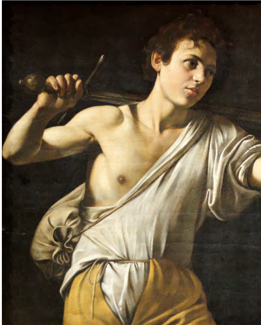
Figure 14. Le Caravage, 1571-1610: David with the Head of Goliath (detail), 1607