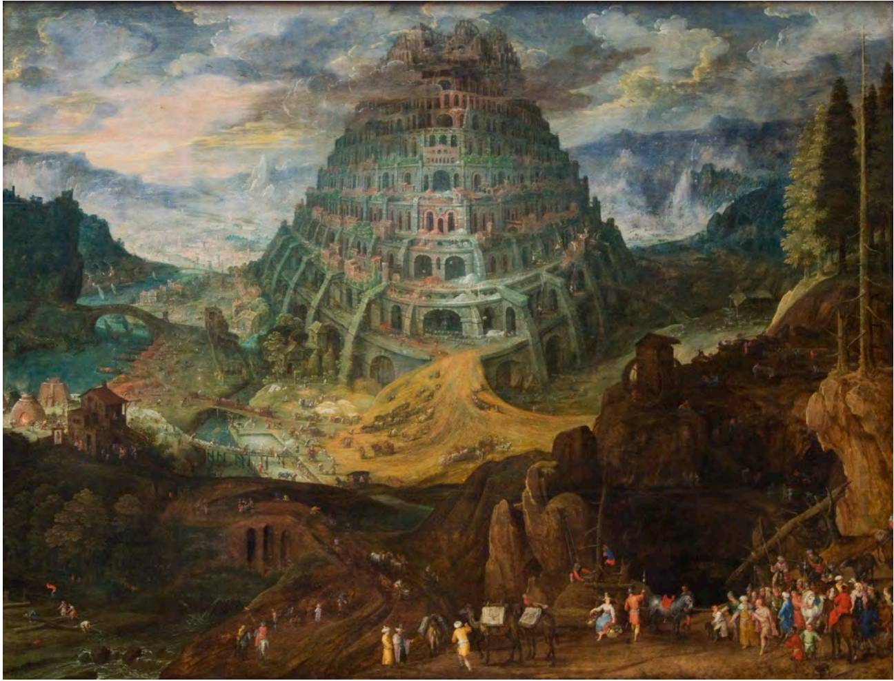
Figure 11. Tobias Verhaecht, 1561-1631: The Tower of Babel