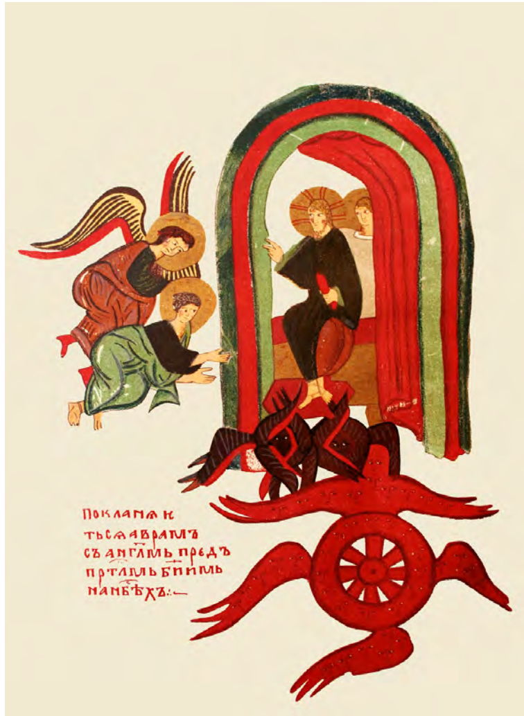
Figure 18. Yahoel and Abraham Approach the Throne of God , ca. 1300

In his insightful discussion of the Greek word teleios , translated “perfect” in Matthew, Jack Welch writes: 88