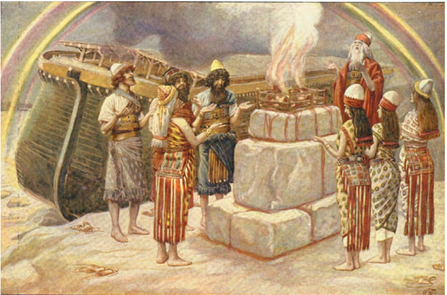
Figure 7. J. James Tissot, 1836-1902: Noah's Sacrifice , ca. 1896-1902