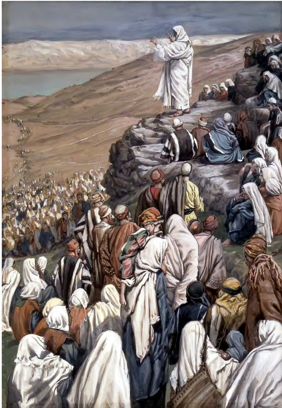
Figure 8. J. James Tissot, 1836-1902: Sermon of the Beatitudes , ca. 1886-1894