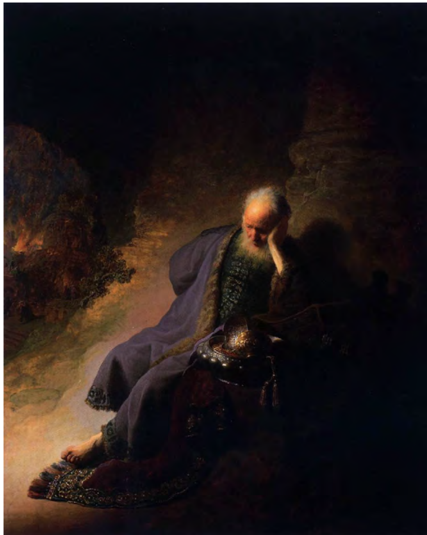
Figure 14. Rembrandt van Rijn, 1606-1669: Jeremiah Lamenting the Destruction of Jerusalem , 1630