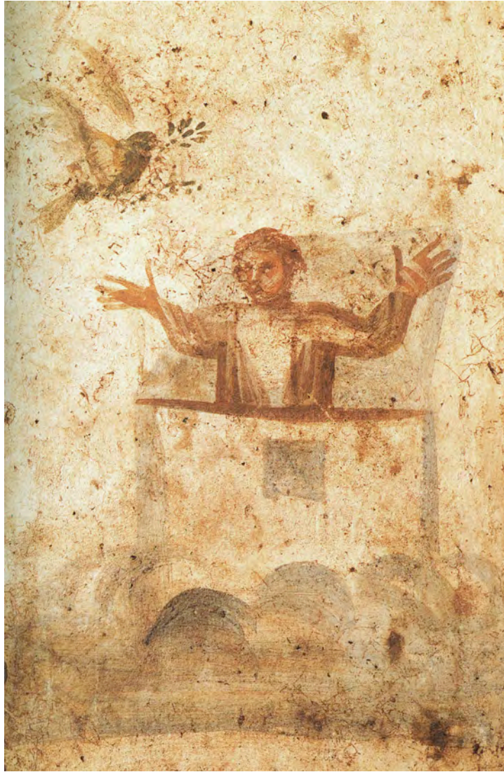
Figure 12. Noah Emerging from the Ark in a Pose of Resurrection