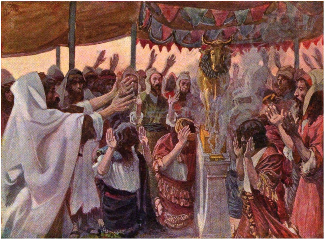
Figure 9. J. James Tissot, 1836-1902: The Golden Calf , ca. 1896-1902