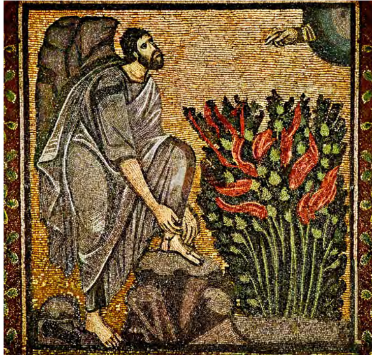
Figure 13. Moses and the Burning Bush , Byzantine Mosaic