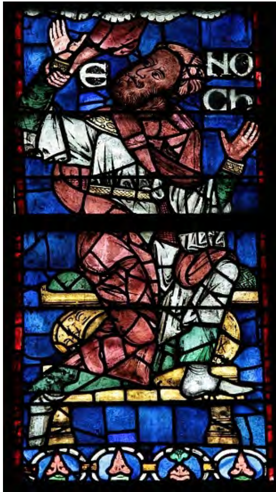
Figure 15. Enoch, Canterbury Cathedral, ca. 1178–1180

The idea of raising the prophet to a level approaching godhood through shared sorrow with the divine is explored at length by theologian Terence Fretheim. 68 Fretheim argues that the prophet’s “sympathy with the divine pathos” was not the result of merely contemplating the divine but instead a result of the prophet’s elevation to become a member of the divine council. He writes: 69