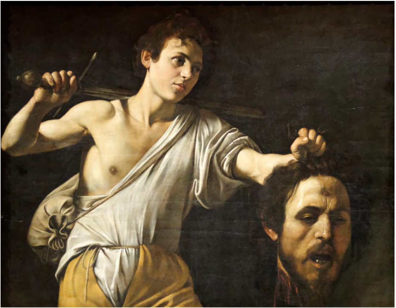
Figure 15. Le Carvage, 1571-1610: David with the Head of Goliath , 1607